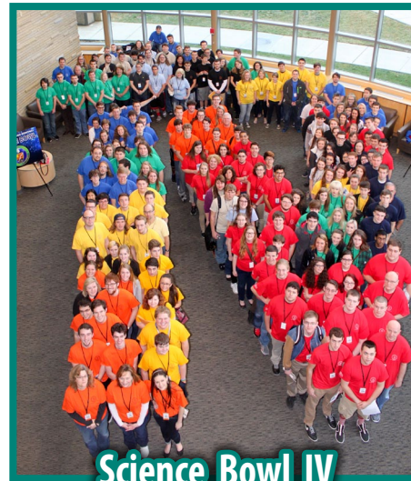
Science Bowl IV