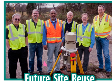
Future Site Reuse