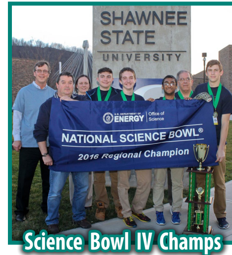
Science Bowl IV Champs